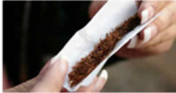
Hand Rolled Cigarette